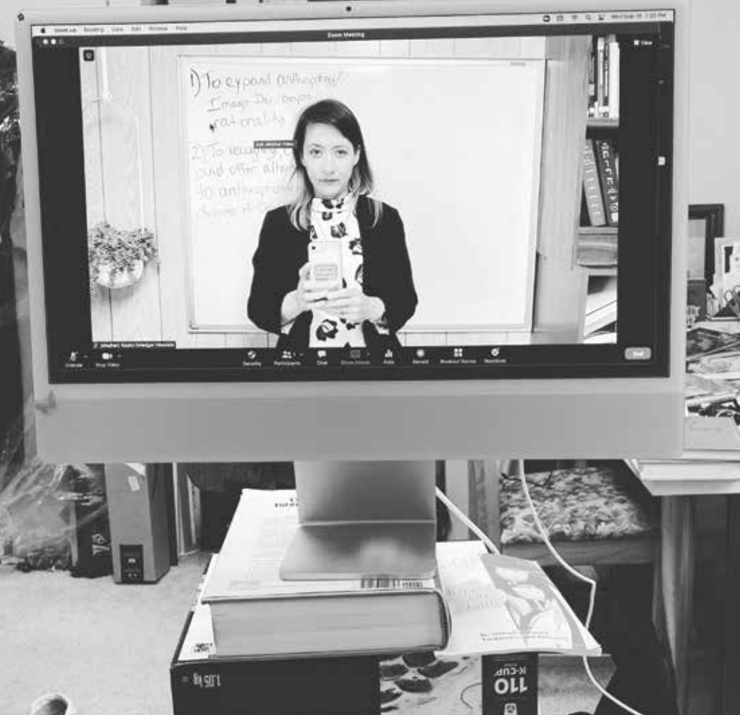
Preparing to teach Theology I.