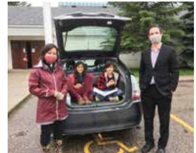
Leaving Advent Lutheran.

calling of all baptized Christians—ordained ministry is only one vocation and is no more “Christian” than any other—but also contradicts what has been identified as necessary leadership for today. Lay leaders have gifts, skills, experiences, and faith that are equal to, and in many ways greater than, those in ordained ministry, and are the future of the church. LTS is working to support lay leaders as a way to support the whole church by facilitating minimal-cost access to the same courses that candidates for ordination take, preferably alongside those candidates, both through immersion courses distributed throughout the four Western Synods and through online learning.