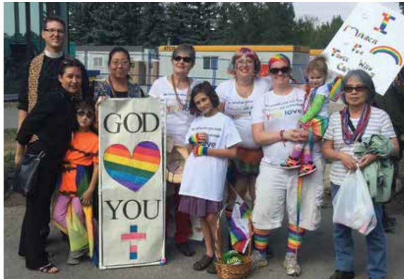
Lutherans Support Pride, at the Calgary Pride Parade.

calling of all baptized Christians—ordained ministry is only one vocation and is no more “Christian” than any other—but also contradicts what has been identified as necessary leadership for today. Lay leaders have gifts, skills, experiences, and faith that are equal to, and in many ways greater than, those in ordained ministry, and are the future of the church. LTS is working to support lay leaders as a way to support the whole church by facilitating minimal-cost access to the same courses that candidates for ordination take, preferably alongside those candidates, both through immersion courses distributed throughout the four Western Synods and through online learning.