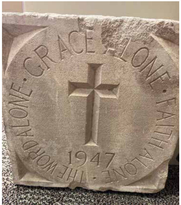
Cornerstone for the old Luther Seminary building.

We are therefore so grateful for every little bit that each of you do to help support the seminary – whether financially, through your time, or through your prayers for our students, staff and faculty. Thank you.